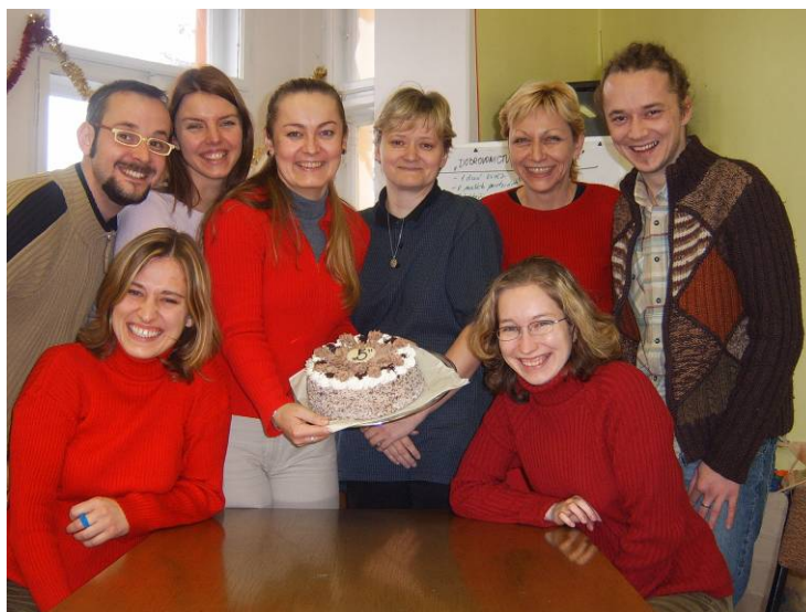
Five years of the