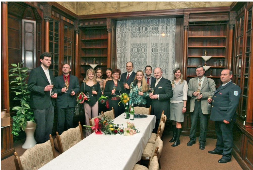
Dear volunteers, thank you for your good hearts!