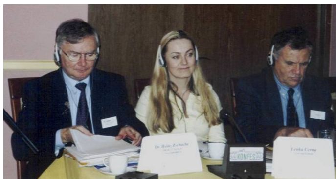
Jeleni Gora – an international conference